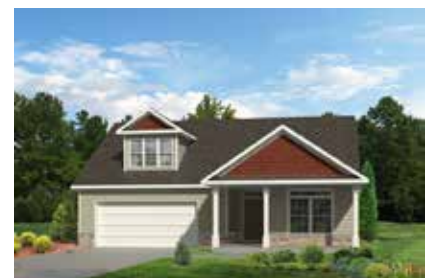
Portico with Bonus