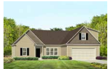
Lily with Bonus